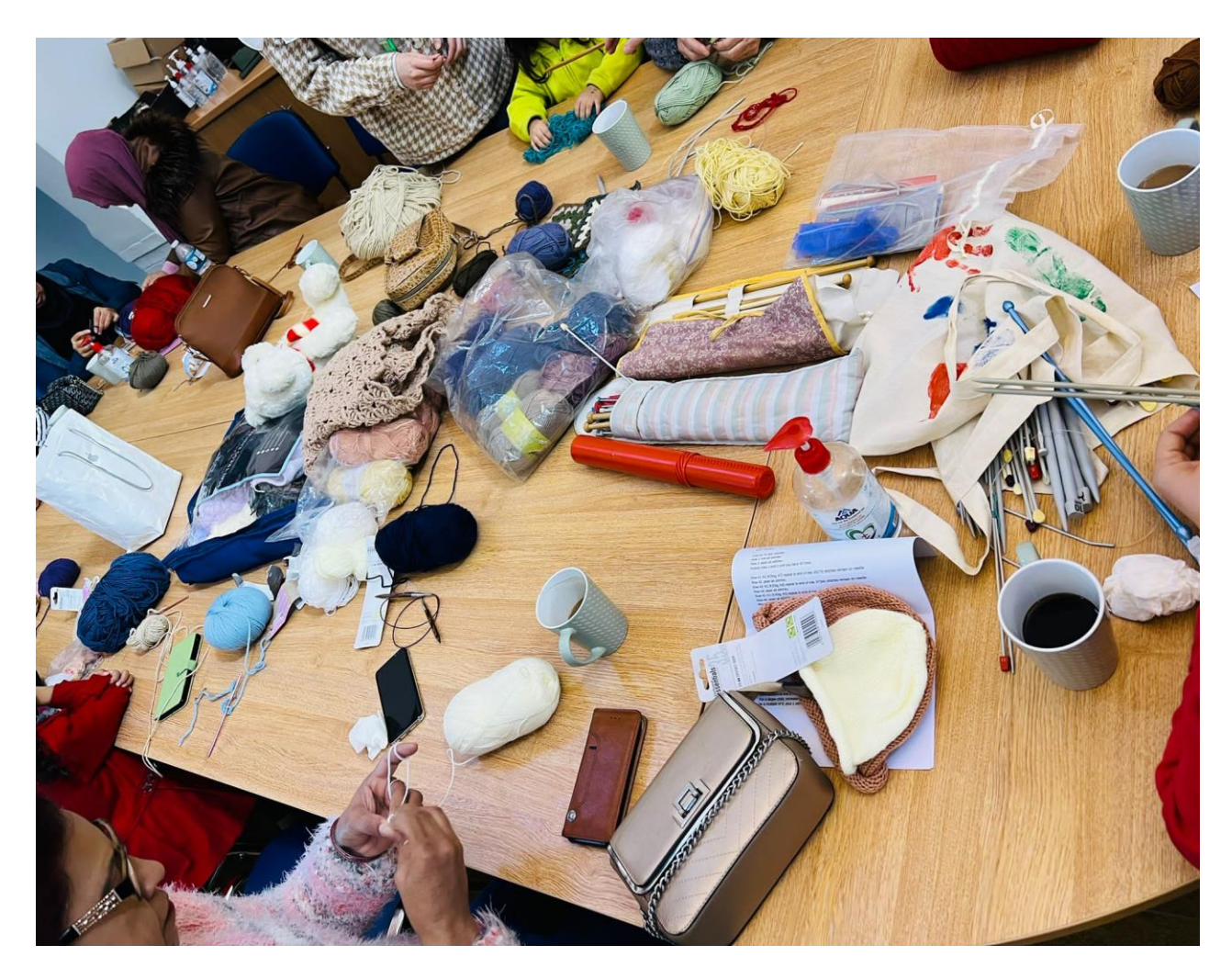
Image: Young females supporting adult females in a sewing activity session